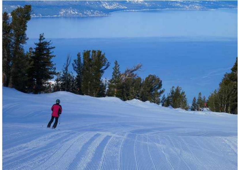
Figure 3 Machine groomed run above Lake Tahoe

The changes outlined above are an industry response to shifting investment and market conditions, new technology, and a warming climate that delivers more rain than snow across the American west. In addition, machine groomed slopes to help beginners learn the sport and extend the career of older skiers, is now standard operating practice (Figure 3). Resorts are also expanding "terrain park" upgrades that feature jumps, railings, and other obstacles favored by snowboarders and a growing skier clientele. The most recent change is to facilitate the explosion of side country (terrain adjacent to resorts) and uphill travel made possible by vastly improved skis, boots, climbing skins, and avalanche gear.