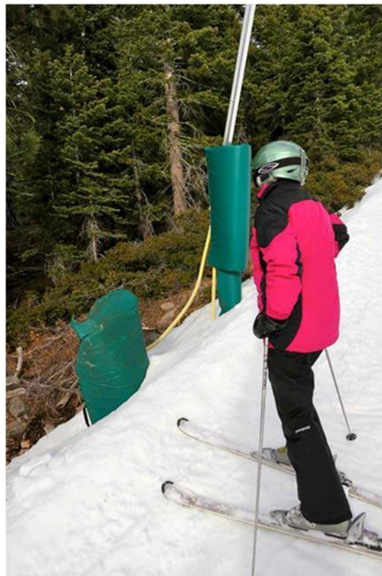
Figure 1 Snowmaking equipment and a manufactured ski run at Northstar, CA, January 2015

The third change is the ongoing industry response to climate change. The winter ski and snowboard season grows shorter each decade (Berwyn 2014, Rich 2014). Mote et al. (2005) found widespread decline in springtime snow water equivalent at 594