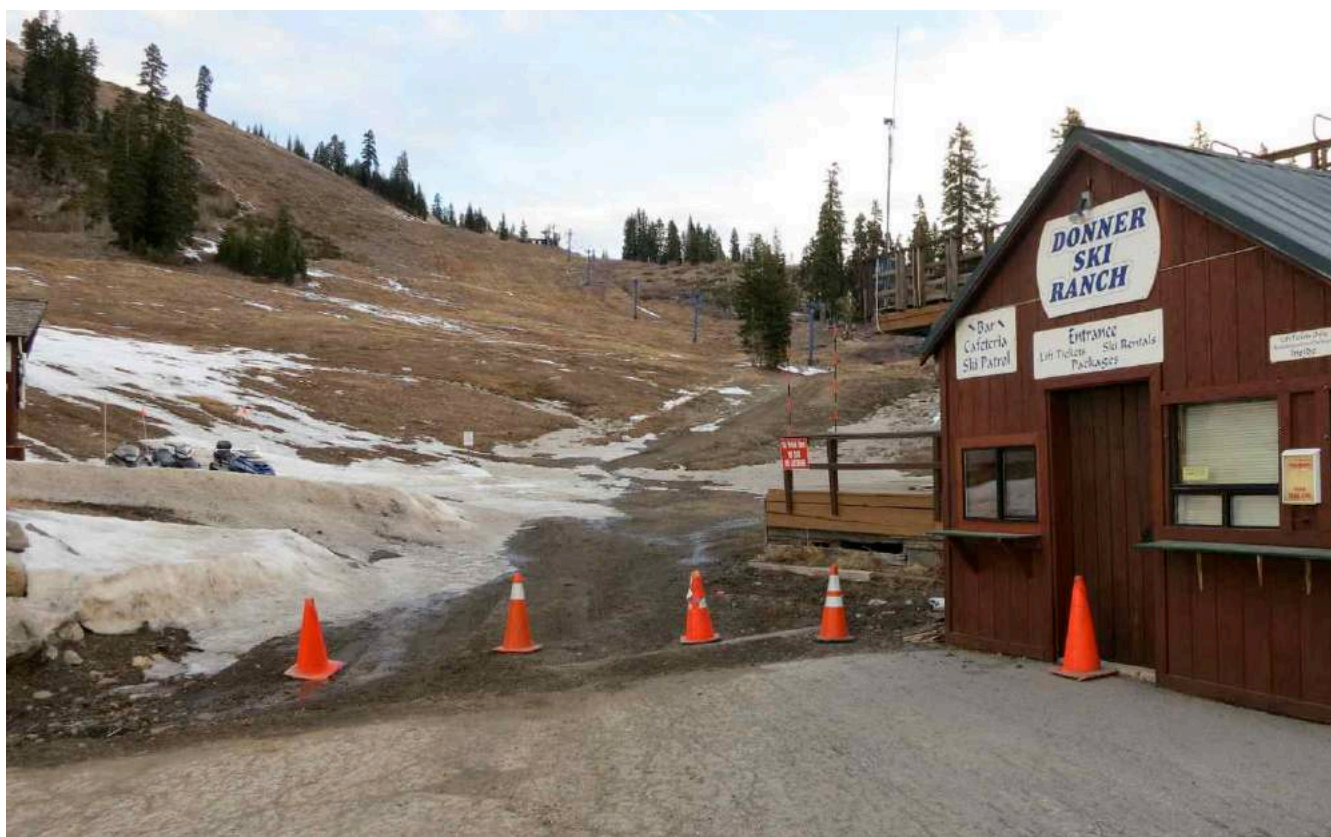
Figure 2 January 2015 drought conditions at Donner Ski Ranch

Vail Resorts, a $3.1 billion Denver-based resort company has equipped Heavenly Valley with some of the most sophisticated and expensive snowmaking equipment in the U.S. The snowmaking staff manages more than 200 air water guns, boom guns, and Super PoleCat fan guns that blow piles of crystals—sometimes a thousand hours a season—for a grooming team of 20 to transform into skiable trails. With 30,000 feet of pipes and hoses, the system can cover 73 percent of the resort's 4,800 acres. In ideal conditions, snowmakers can fabricate winter at the rate of a foot of snow over 43 acres in just 12 hours.