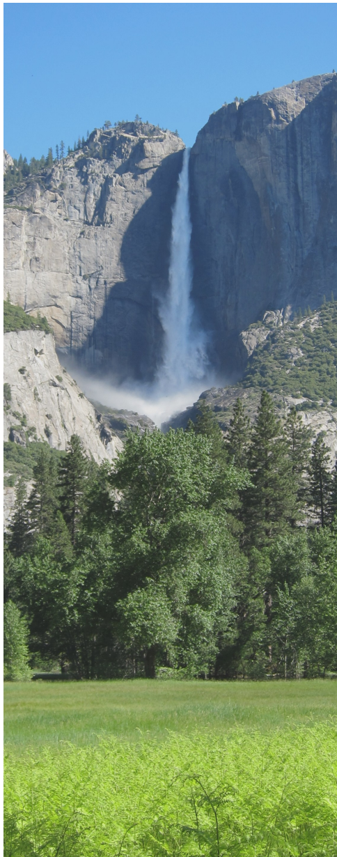
(Yosemite, Yosemite Falls, June 29, 2011).