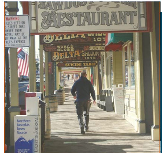
View down C Street, Virginia City, Nevada. View of the city's main shopping corridor, dominated by businesses catering to tourists and promoting an aggrandized Wild West image.