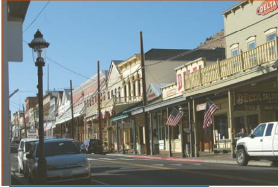
Another view down C Street, Virginia City, Nevada.

ploring what were otherwise strictly enforced social taboos. San Francisco provided the entertainers, and Virginia City allowed them the freedom to perform unrestrained.