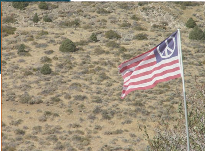
South C Street outside of Gold Hill, Virginia City, Nevada. Vestiges of the Red Dog's psychedelic past and the inhabitants that it attracted are scattered throughout the Comstock community as attested by this "Hippie" flag.