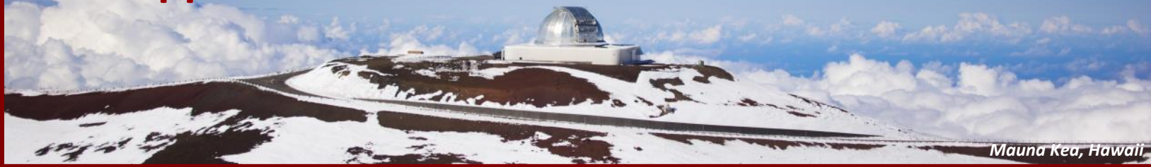
Mauna Kea, Hawaii