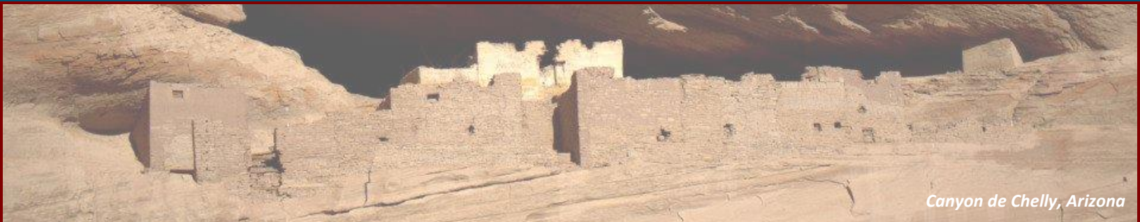
Canyon de Chelly, Arizona