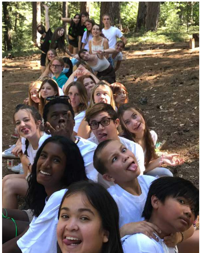
The spatially aware Sugarloaf Thespians.